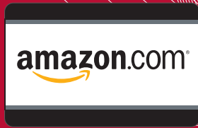
Amazon.com Gift Card