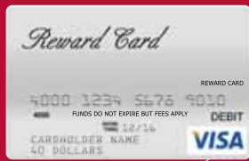
Visa® Prepaid Card