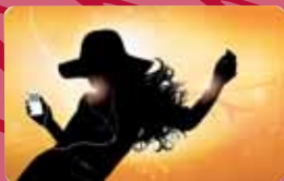
iTunes® Gift Card